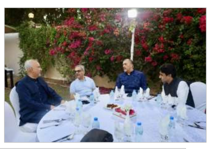
14 April 23: Community Iftar Dinner held at Pakistan Embassy Abu Dhabi