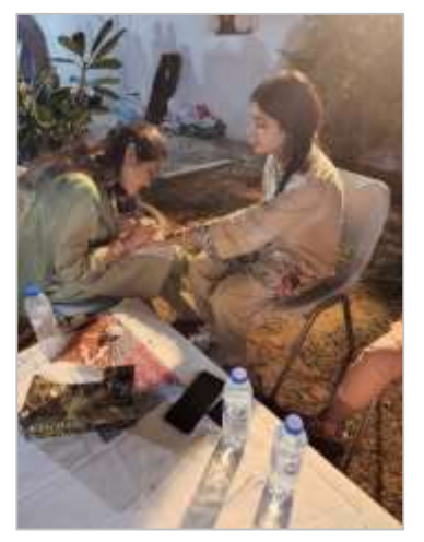
Glimpses of Chand Raat Celebrations/ Eid Souk at Pakistan Embassy in Abu Dhabi.